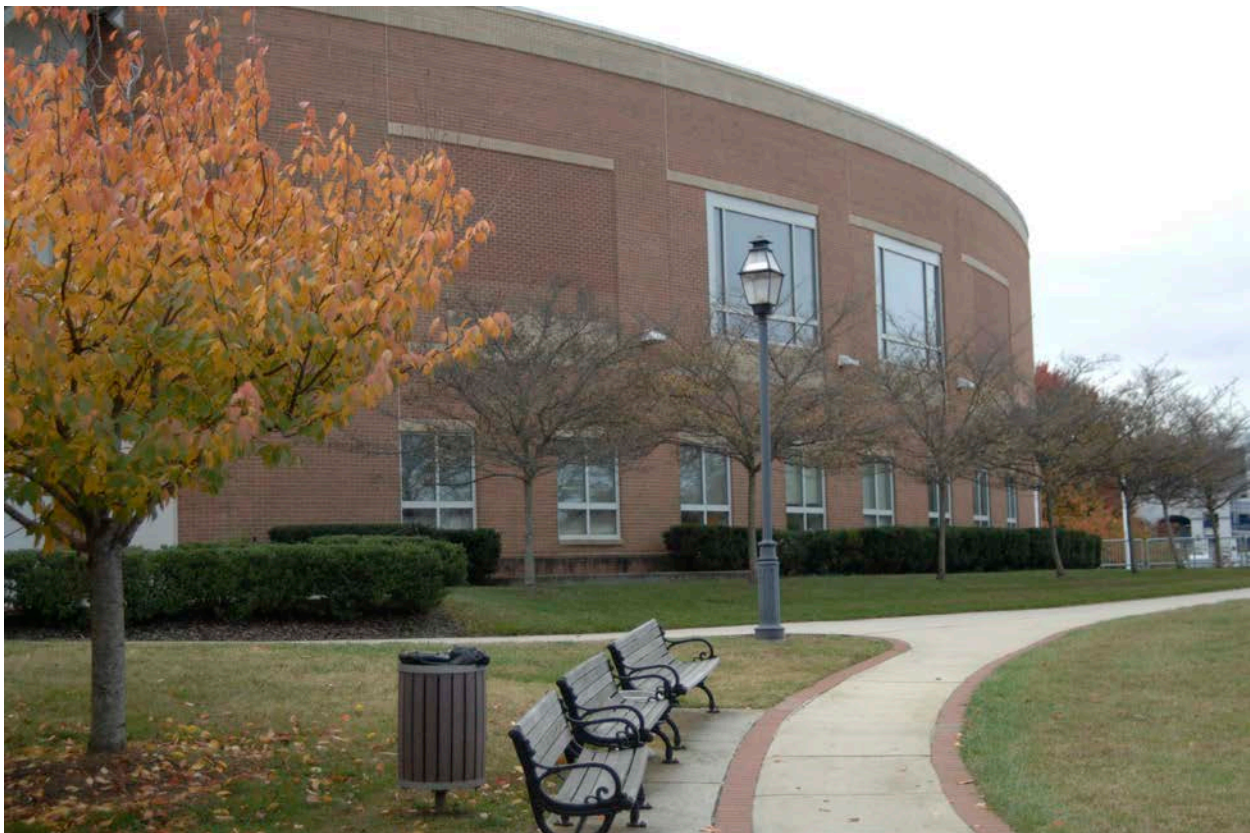
District Court of Anne Arundel County – Annapolis Location

The following tables provide a statistical representation of the workload for Fiscal Year 2013 in the District Court.