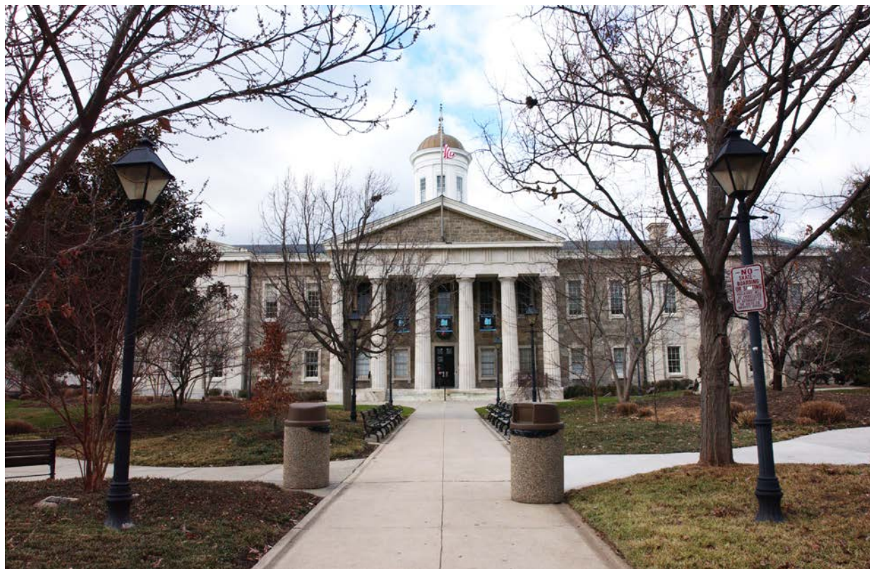
Circuit Court for Baltimore County

The following tables provide a statistical depiction of the workload in the circuit courts for Fiscal Year 2013.