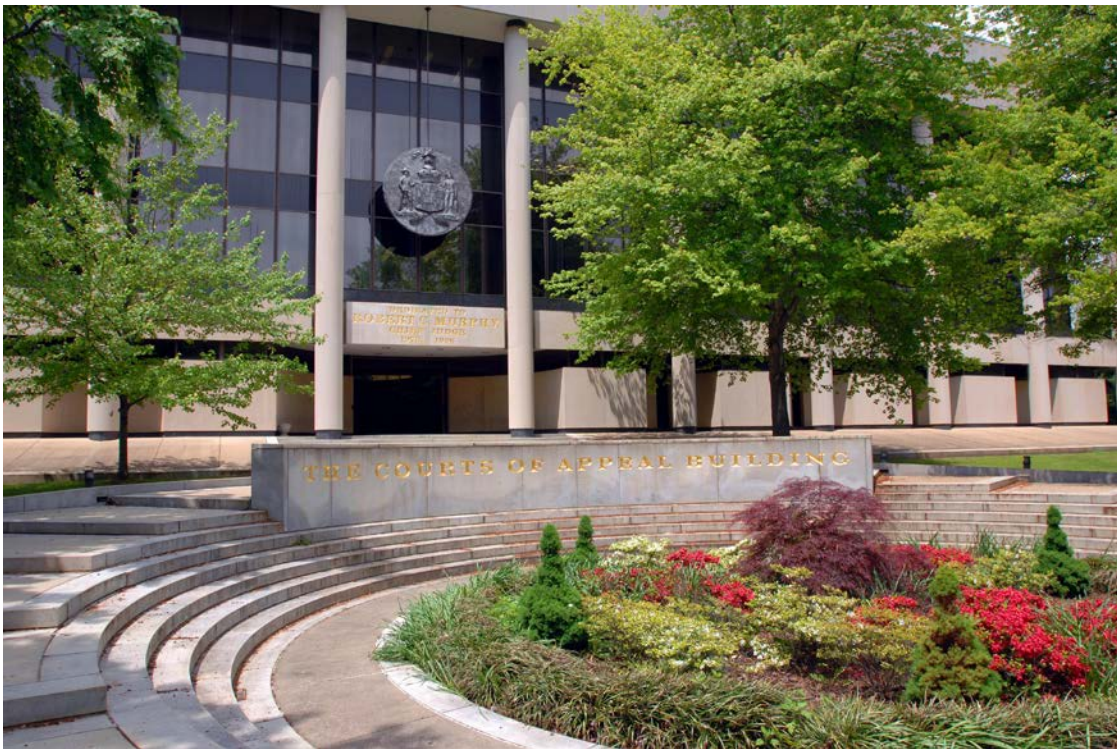
Robert C. Murphy Courts of Appeal Building Annapolis, Maryland

The following tables provide a statistical depiction of the Court’s workload for Fiscal Year 2013.