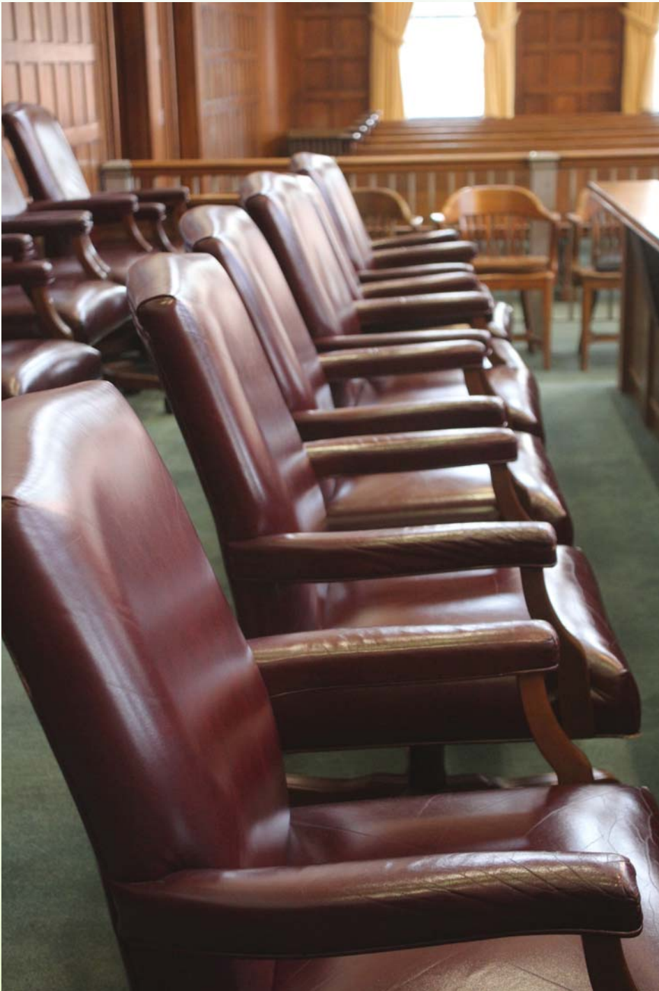
Allegheny County Circuit Courthouse, Cumberland, MD

ANNUAL STATISTICAL ABSTRACT Fiscal Year 2013