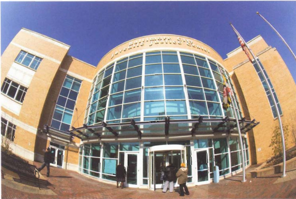
The Baltimore City Juvenile Justice Center